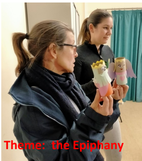
Theme: the Epiphany