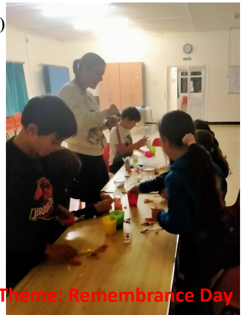
Theme: Remembrance Day